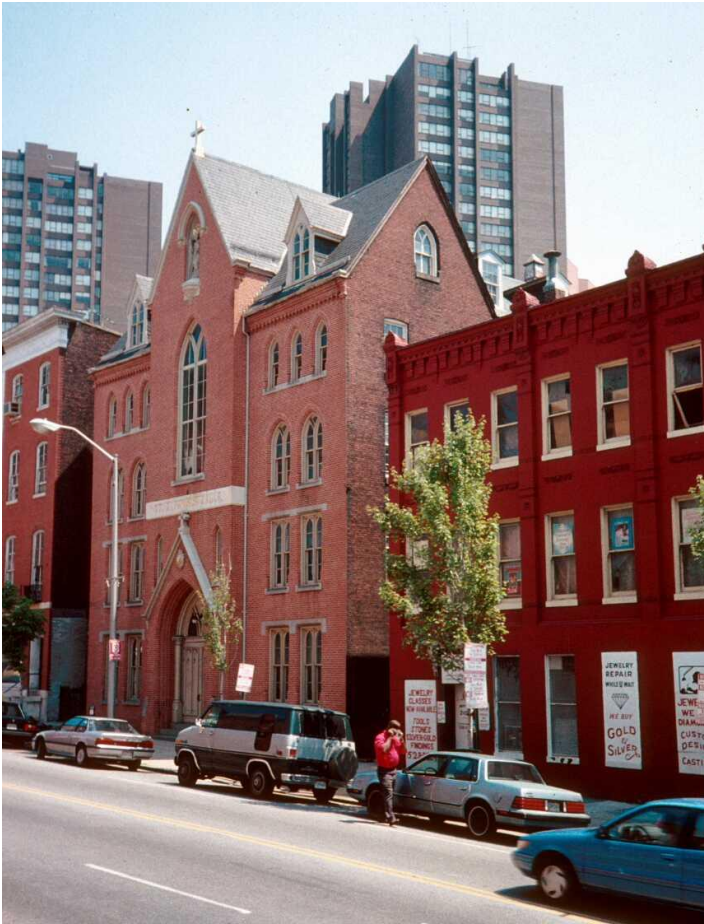
National Register Nomination Photo, taken by Diane Shaw, 08/1991