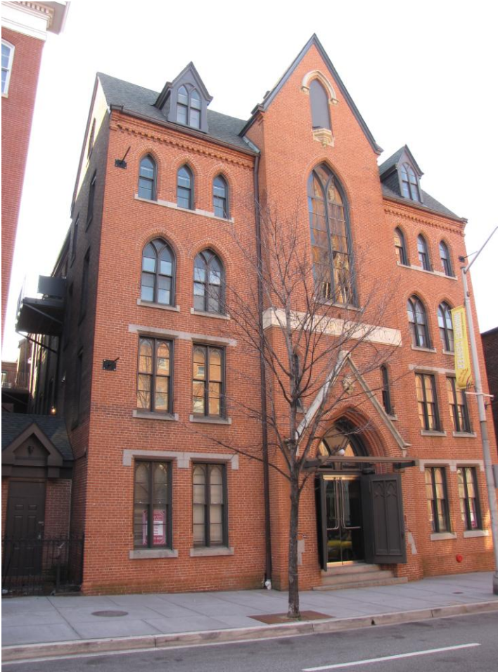
View from northwest, across W. Saratoga St.