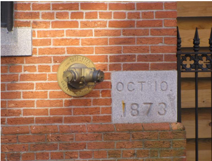
Datestone on east corner of façade.