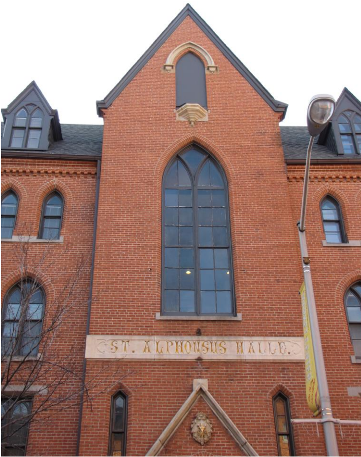
Detail of cross gable façade.